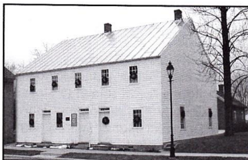
NBHA Museum - 120 N. Main St.

New Bremen Historic Association P.O. Box 73 New Bremen, Ohio 45869-0073