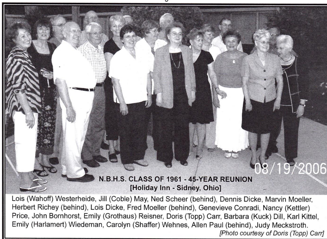
N.B.H.S. CLASS OF 1961 - 45-YEAR REUNION [Holiday Inn - Sidney, Ohio]