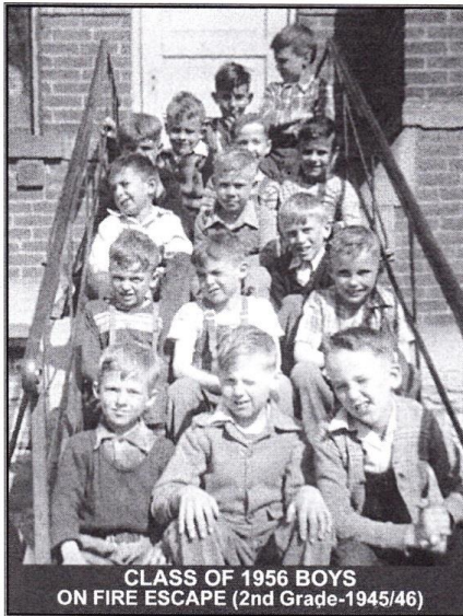
CLASS OF 1956 BOYS ON FIRE ESCAPE (2nd Grade-1945/46)