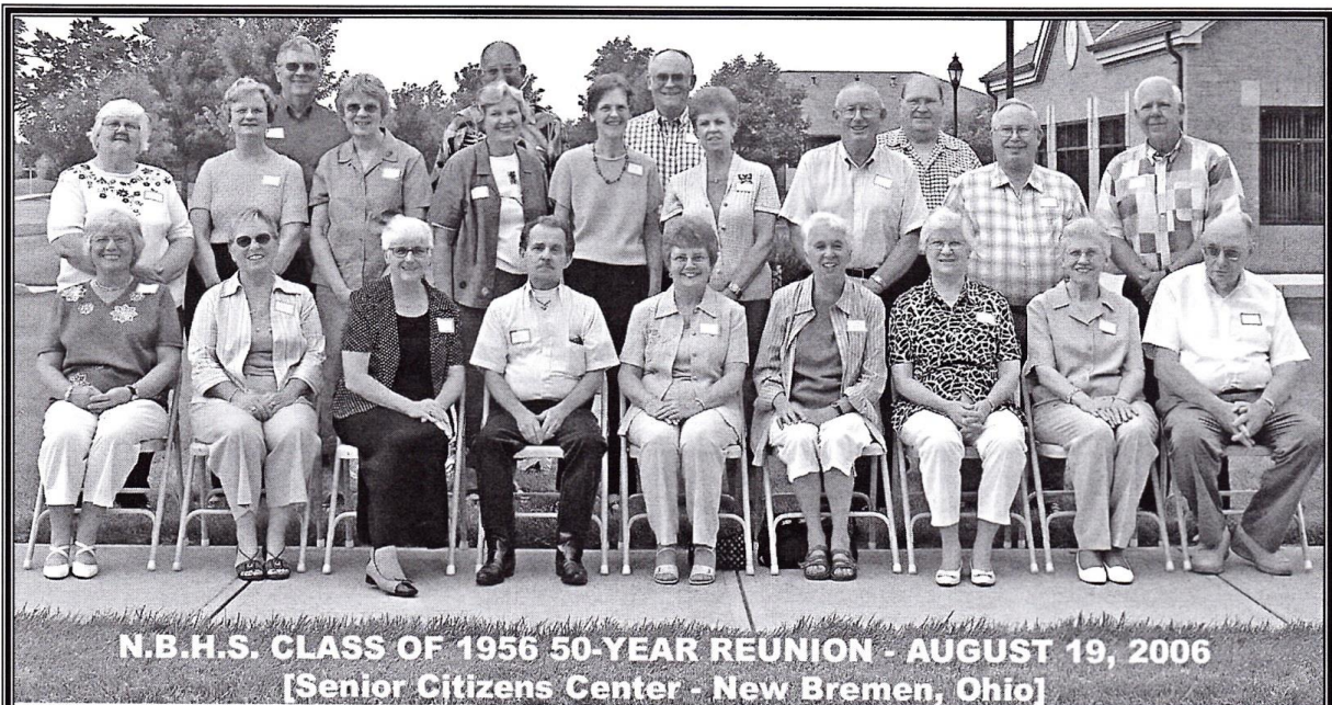
N.B.H.S. CLASS OF 1956 50-YEAR REUNION - AUGUST 19, 2006 [Senior Citizens Center - New Bremen, Ohio]