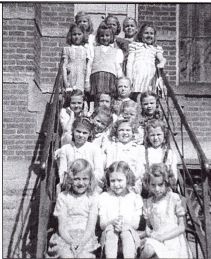
CLASS OF 1956 GIRLS ON FIRE ESCAPE (2nd Grade-1945/46)